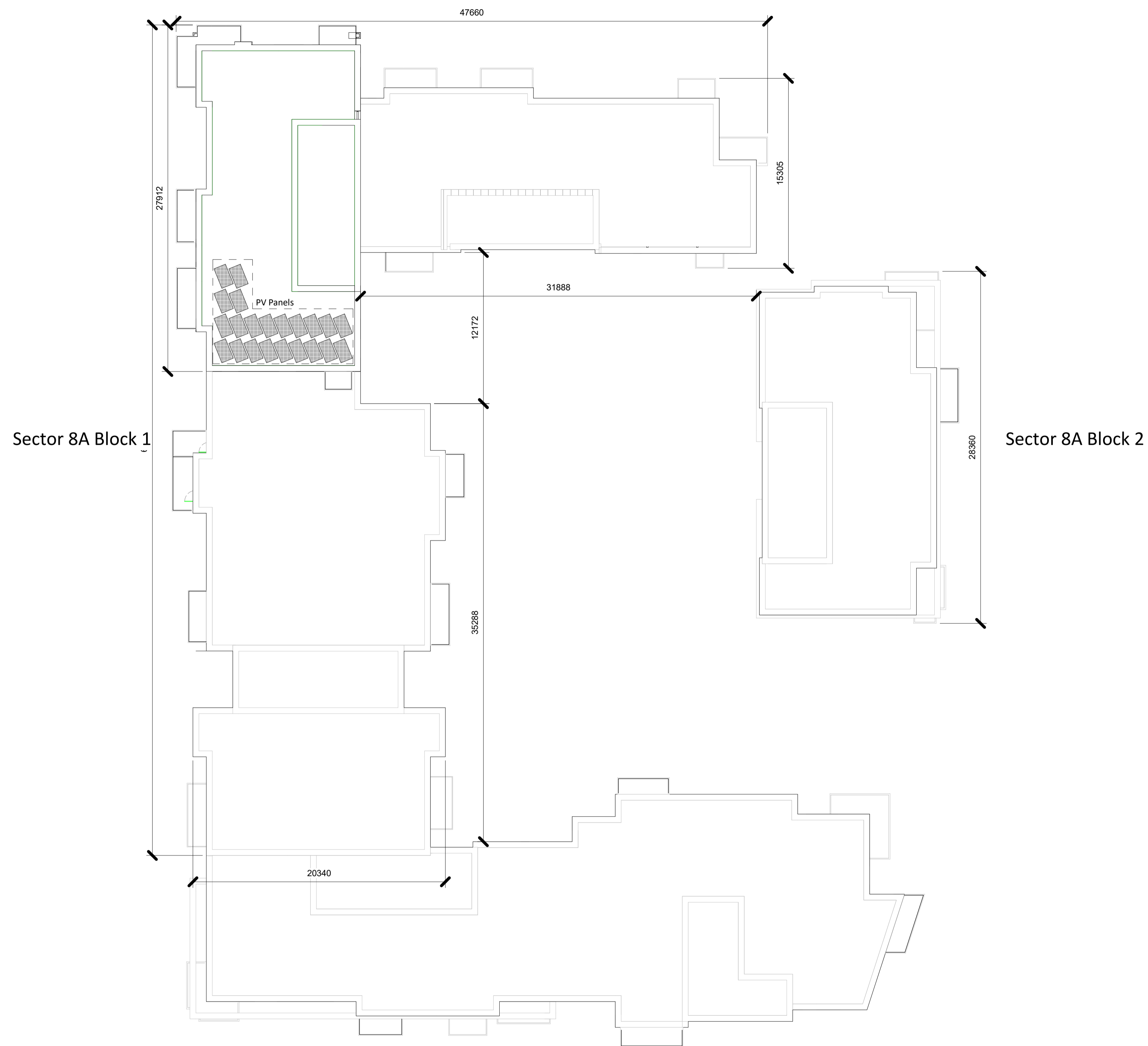
11 Roof Plan 1-200 1 1 : 200

Community rooms (sector 8A) 1 room Bicycle Storage (sector 8A) at g.l. 169 units